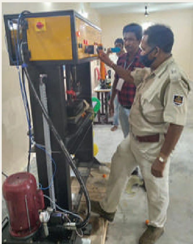
Operationalization of Sal Leaf Cluster under Rairangpur Division