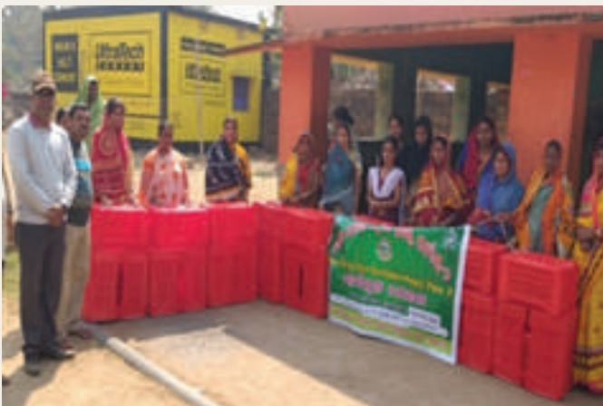
Distribution of Crates and Vegetable seeds in VSSs in Dhenkanal Forest Division