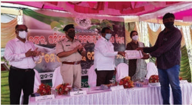
Felicitation of Baghapali VSS in Biju Pattnaik Award by Forest, Environment & Climate Change Dept.

Hajapalli VSS of Jagannathprasad FMU under Ghumsur North Division is situated about 20 KMs away from the Forest Range Office and 50 KMs away from Ghumsur North Forest Division Office. The VSS is having 21 numbers of households with a population of 77 members.