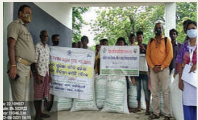
Distribution of Ground nut seeds to 200 beneficiaries shortlisted in Bangoriposhi Forest Rage under OFSDP-II