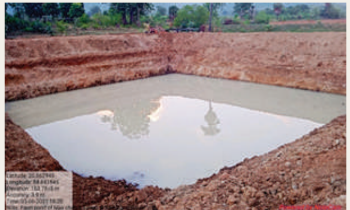
Farm Pond excavated in Kendupati Dalaki VSS in Athamallik Forest Division

be certainly helpful in providing water for irrigation and dual crop growing. It will also boost-up integrated farming. This convergence initiated under OFSDP Phase-II has built-up the confidence of VSS members on Forest Department because of the support rendered by the Department at the time of their distress.