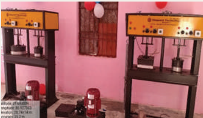
Operationalization of Sal Leaf Cluster under Baripada Division