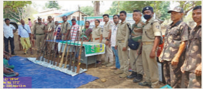
Community members of the Aswakuti VSS in the felicitation programme after the seizure of local guns from the hunters under Baripada Forest Division