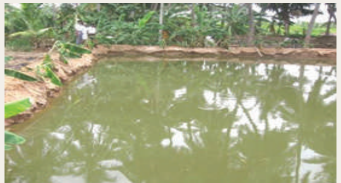
Integrated farming system with convergence in Kendupati-Dalaki VSS in Athamallik Forest Division