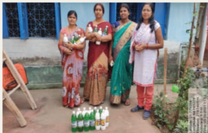
Empowerment of SHG members through capacity building in Dhengujore VSS under Jharsuguda Forest Division