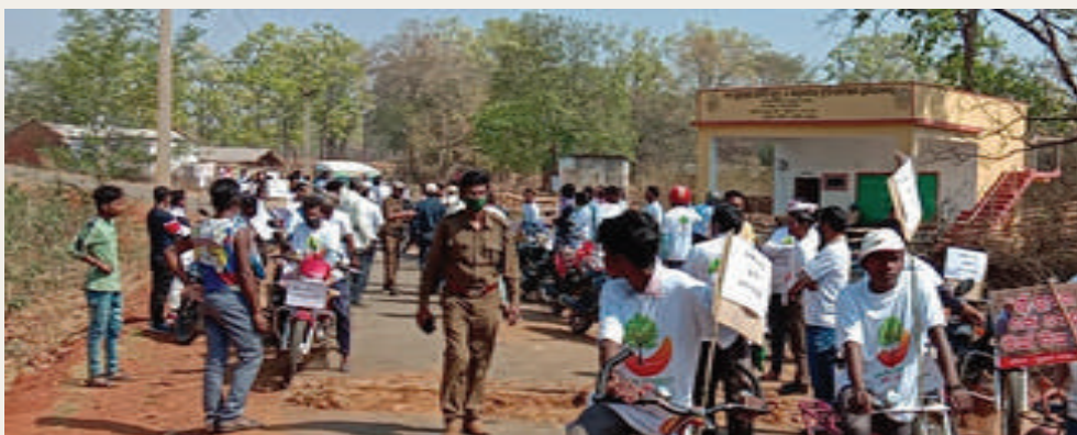
Community rally in Karanjia for Forest fire protection

Since then the Executive Committee members of the VSS are conducting regular VSS meetings, General Body meetings. EC members keep all the VSS Registers up to date and monitor all the VSS level works. Pahadpur VSS members in the last quarter decided to create a massive awareness programme at Block level on Forest Fire to protect Budipahad DPF. The VSS has been assigned with 156.96 Ha. forest area for protection and management. A meeting was organized at Pahadpur VSS and DFO cum DMU Chief joined the meeting as Chief Guest. PA-ITDA, block level officials, local community building organisations participated in the sensitization campaign. In order to sensitize each one on forest fire and community's role in forest protection and forest fire management, a cycle rally was organized before the meeting to sensitize the stakeholders of the villages surrounding Budipahat DPF. The Cycle Rally started from Ramasahi VSS, covered nearly 10 Kms. and reached Pahadpur village, the destination. Forest officials, District level officials and Civil Society stakeholders appreciated the outreach programme of the VSS on Forest Fire. It was also opined by all the participants that periodic interactions among the VSS members through such sort of activities are immensely helpful for mass involvement in Forest protection.