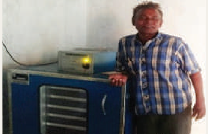
Solar Dryer placed in the newly constructed Preservation Home