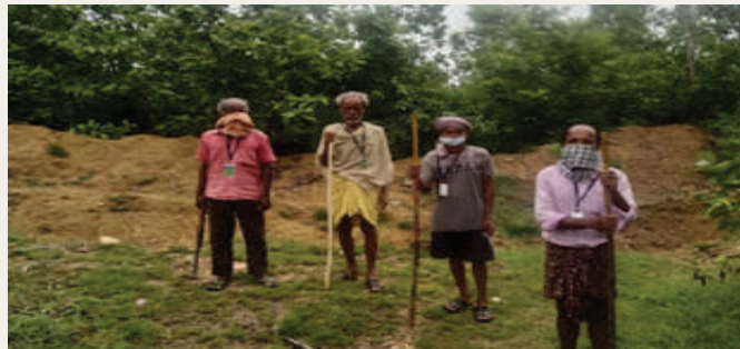
Felicitation of Hajapalli VSS with Biju Pattnaik Award by Forest, Environment & Climate Change Department